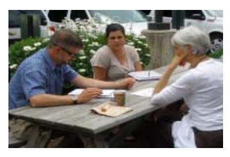
A second Writing Institute and the Reading and Literature Institute

an Institute in Teaching Writing will be held at the Bucks County IU in Doylestown June 28 - July 22.