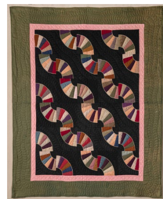
"Double Wedding Ring", 1915

GrantForward: A quick reminder to check out our funding opportunity database, GrantForward.