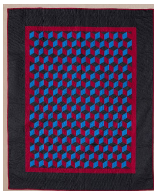
"Tumbling Blocks", 1930