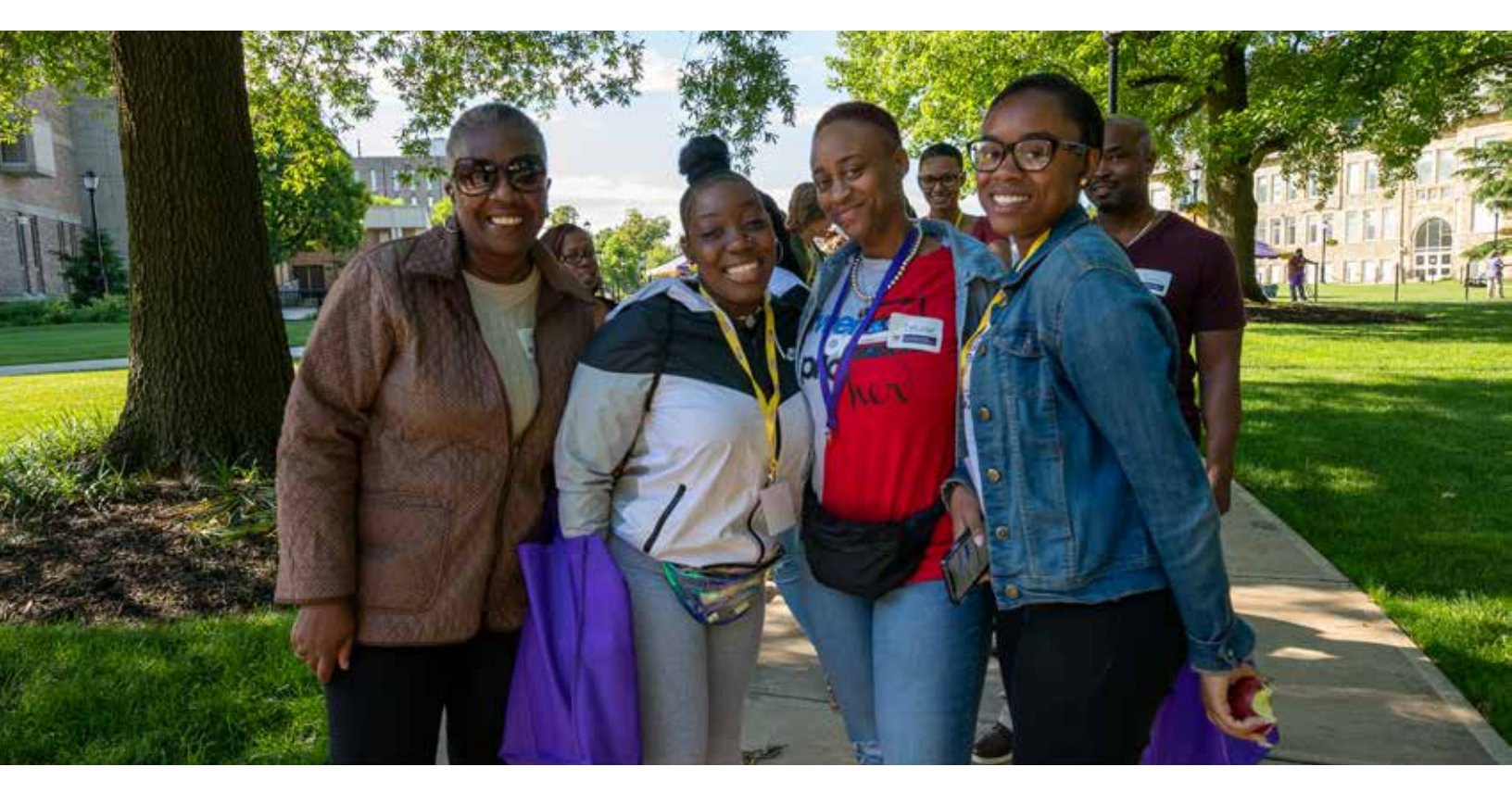
A Parent Handbook for Talking with College Students About Alcohol

Binge drinkers tend to associate with others who tend to binge drink (e.g., Everyone at my age is doing it, My friends will think I am strange if I do not drink, It can't be that bad if everyone is doing it).