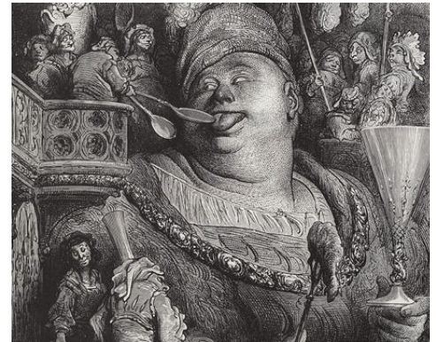
Gargantua F. Rabelais