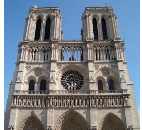
Notre-Dame de Paris V. Hugo

Alexandre Dumas La Dame aux Camélias Notre-Dame de Paris V. Hugo George Sand Le Compagnon du Tour de France François Rabelais Gargantua Gilbert Cesbron Il est minuit, docteur Schweitzer Victor Hugo Notre-Dame de Paris Michel de Montaigne Journal de Voyage P. Valéry, Ch. Baudelaire, P. Claudel. Arthur Rimbaud Ophélie Marcel Pagnol Jean de Florette