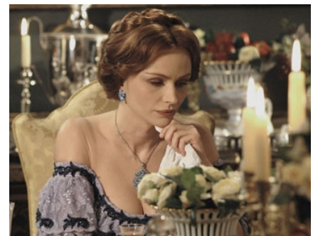
La Dame aux Camélias - Dumas

During these two weeks of intensive study, we will explore how various art forms are represented in literary works. For instance, we will read an excerpt of Victor Hugo's Notre – Dame de Paris , while discussing cathedrals. What are the art forms surveyed in this course? Pure art such as music, poetry, painting; artisanal crafts; and “l'art de vivre” which is at the core of French life.