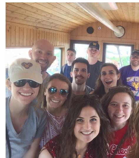
Inside the Wiener Riesenrad (Giant Wheel) 2016

the University of Pennsylvania for his Ph.D. in German and Austrian literature. His academic interests include twentieth century German and Austrian literature, German-Jewish history, the Holocaust, and German and Austrian Film, and he was published several articles on these topics in scholarly books over the past few years.