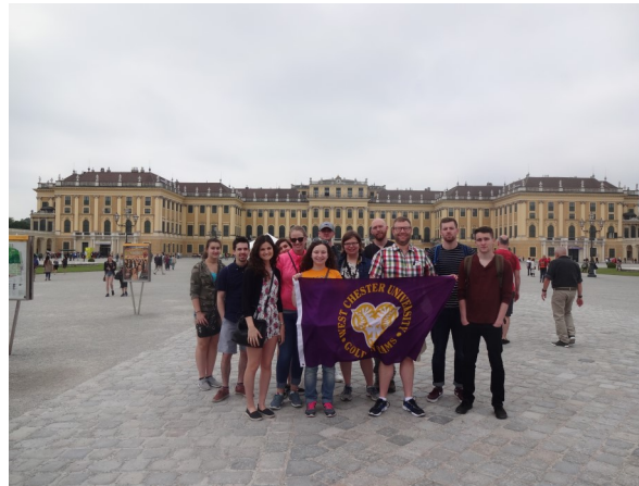
Students at Palace Schönbrunn 2016