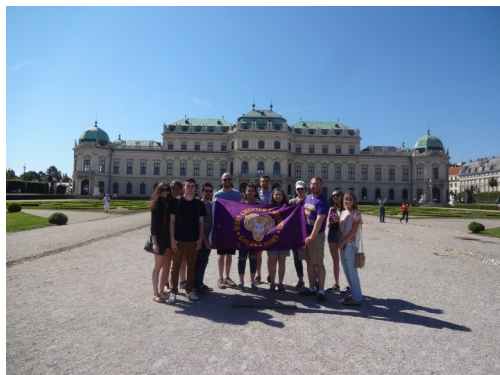
Students in front of Vienna's Belvedere Palace 2016