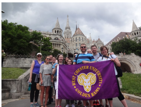
Students in Budapest 2016