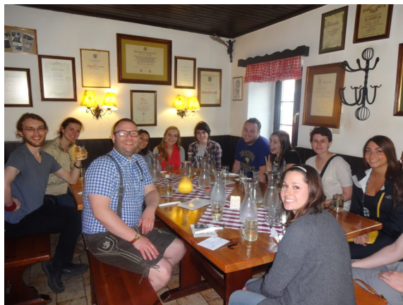
Students at Viennese Restaurant in 2015

Pre-requisite: German 102 or the equivalent.