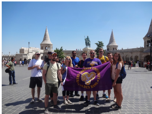
Students in Budapest 2017