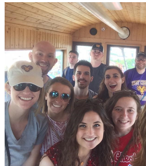
Inside the Wiener Riesenrad (Giant Wheel) 2016

German and Austrian literature. His academic interests include twentieth century German and Austrian literature, German-Jewish history, the Holocaust, and German and Austrian Film, and he was published several articles on these topics in scholarly books over the past few years.