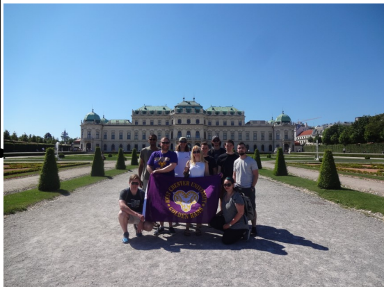
Students in front of Vienna's Belvedere Palace 2017