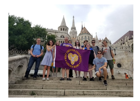
Students in Budapest 2018