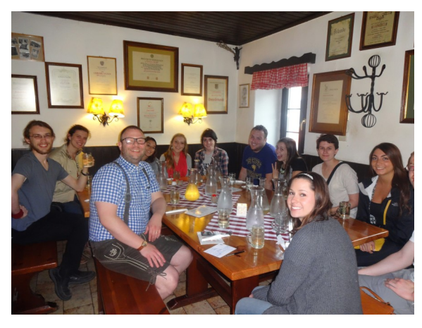
Students at Viennese Restaurant in 2015

Pre-requisite: German 102 or the equivalent.