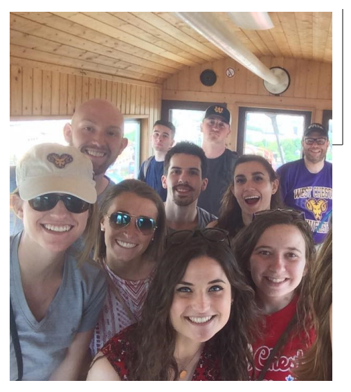
Inside the Wiener Riesenrad (Giant Wheel) 2016

German and Austrian literature. His academic interests include twentieth century German and Austrian literature, German-Jewish history, the Holocaust, and German and Austrian Film, and he was published several articles on these topics in scholarly books over the past few years.