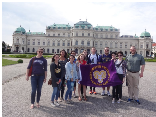
Students in front of Vienna's Belvedere Palace 2015