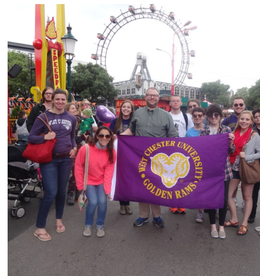
Wiener Riesenrad (Giant Wheel) 2015

the University of Pennsylvania for his Ph.D. in German and Austrian literature. His academic interests include twentieth century German and Austrian literature, German-Jewish history, the Holocaust, and German and Austrian Film, and he was published several articles on these topics in scholarly books over the past few years.