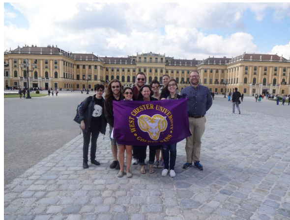
Students at Palace Schönbrunn 2015