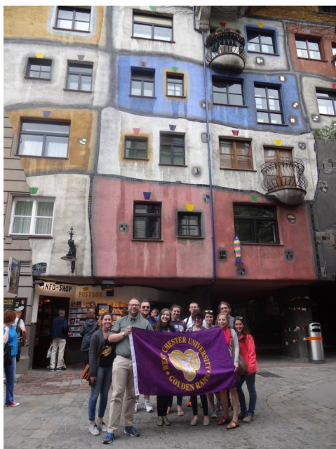
Student group at Hundertwasserhaus 2015