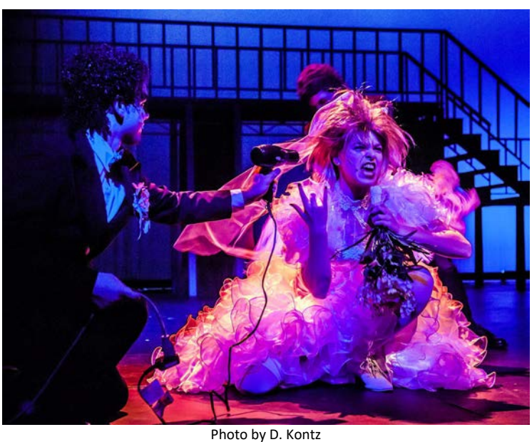
Updated / Edited by: Martin Dallago / Departmental Faculty on 8/21/2017