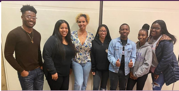
Dowdy Multicultural Center