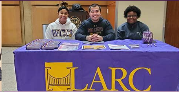
LARC (Learning Assistance and Resource Center)