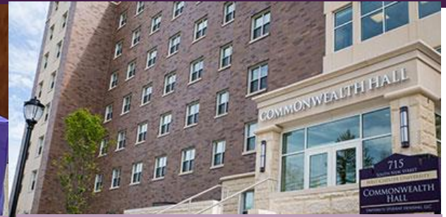
Health Center Counseling and Psychological Services