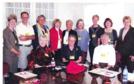
Retired Fellows discovered they had a combined total of over 300 years of teaching experience!