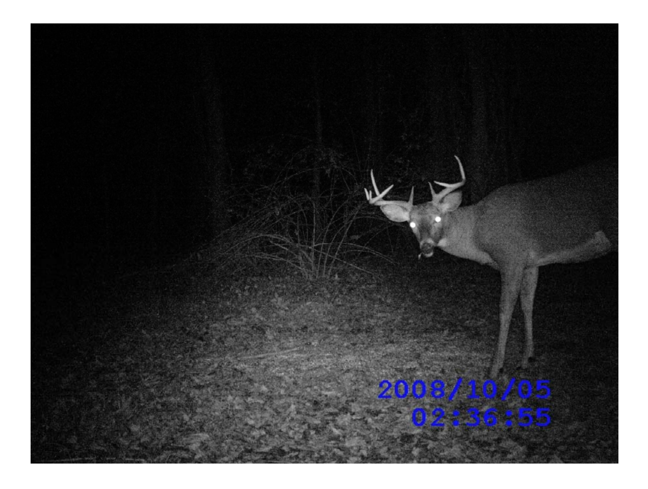
Figure 1. Photograph of a uniquely antlered buck captured by an infrared-triggered camera during baited infrared camera surveys conducted by USDA APHIS Wildlife Services to estimate white-tailed deer abundance on the Robert B. Gordon Natural Area at West Chester University, Chester County, PA during September and October 2008.