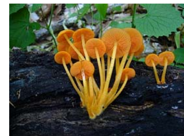
Golden Fairy Helmet

QuickTime™ and a TIFF (Uncompressed) decompressor are needed to see this picture.