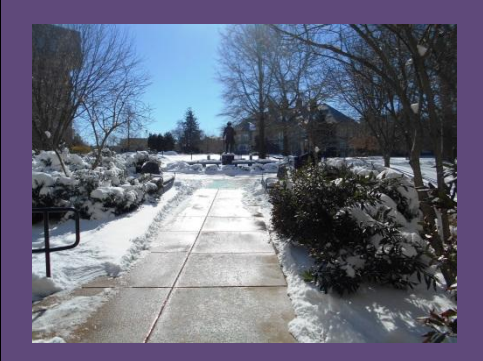
SCENES FROM THE 2<sup>ND</sup> DAY OF THE SEMESTER . . . NO CLASSES