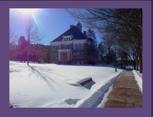
SCENES FROM THE 1<sup>st</sup> DAY OF THE SEMESTER . . . NO CLASSES _____