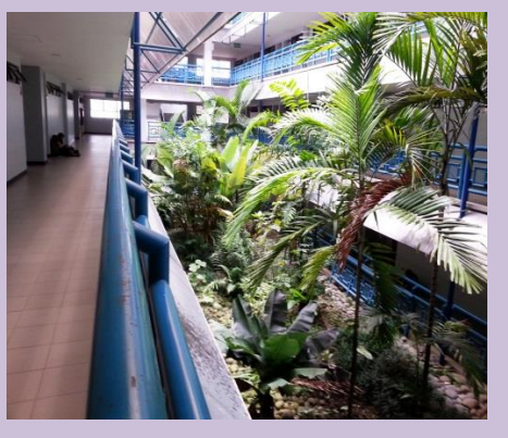
Conference Hotel Atrium