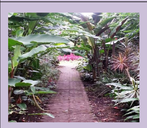
Conference Hotel Garden