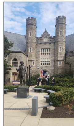
WCU ROTC prepares prior to the inauguration in the shadow of the Frederick Douglass statue and Philips Memorial Building.