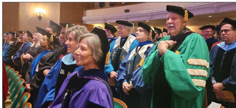
Dressing up for an inauguration.