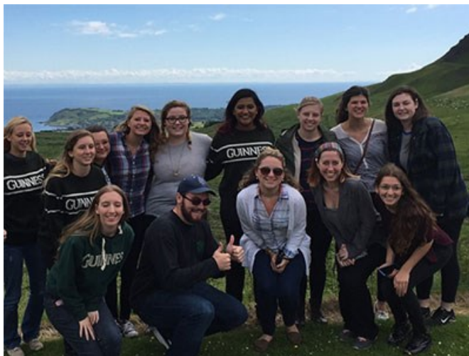
WCU students at the Cliffs of Moher