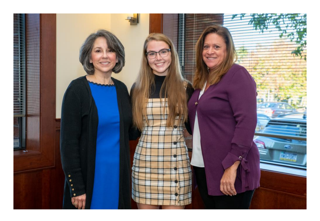
West Pharmaceutical Services Biomedical Engineering Scholarship Award