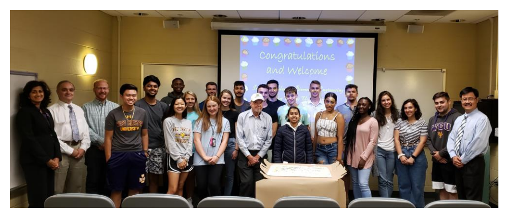
Inaugural Biomedical Engineering class picture

Currently BME we has three technical electives in the 7<sup>th</sup> and 8<sup>th</sup> semester. These three technical electives reflect three major areas in BME, i.e., Biomechanics, Bioinstrumentation, and Cell and Tissue Engineering. Technical electives may change depending on enrollment, faculty research focus areas, and interest of the student body. etc. For more information, please contact the BME faculty.