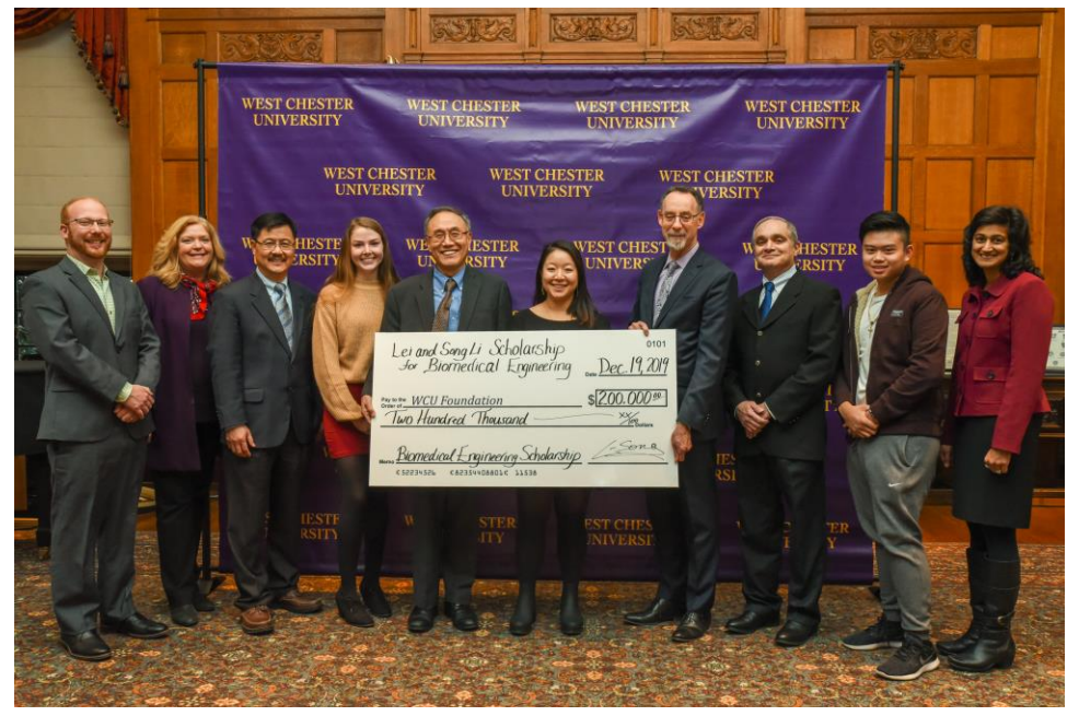
The Lei and Song Family Award in Biomedical Engineering check presentation.