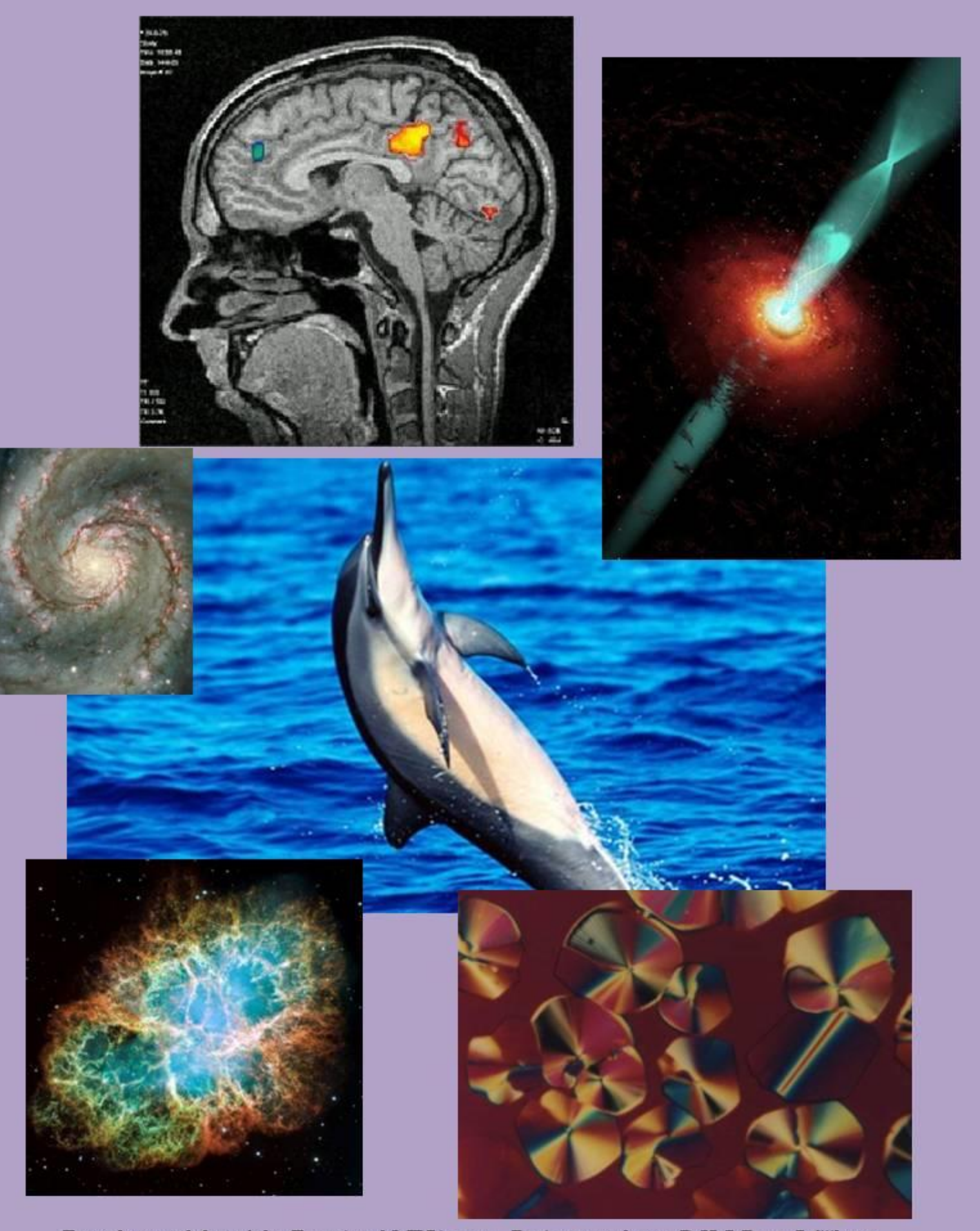
Top to bottom, left to right: Functional MRI image – Project members: D.H.J. Poot, J. Siibers, A.J. den Dekker; A shock wave tracing a spiral path away from the black hole (Copyright © Dr Wolfgang Steffen); Whirlpool Galaxy (photo: NASA); Spinner Dolphin (photo: Alamy); Crab Nebula supernova remnant (photo: NASA); and pyramidic liquid crystal (photo: Zeev Luz).