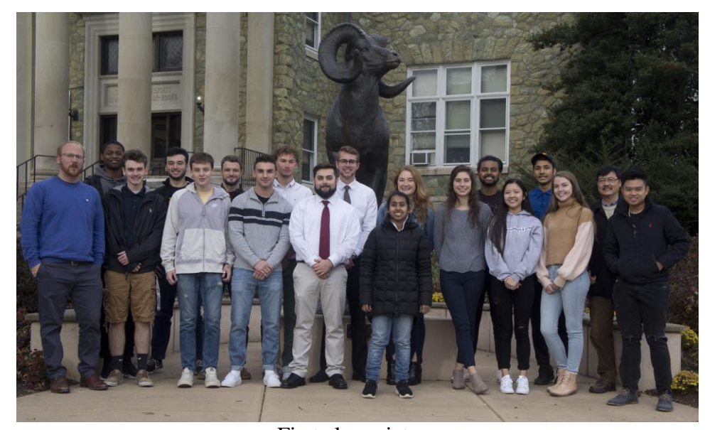
First class picture