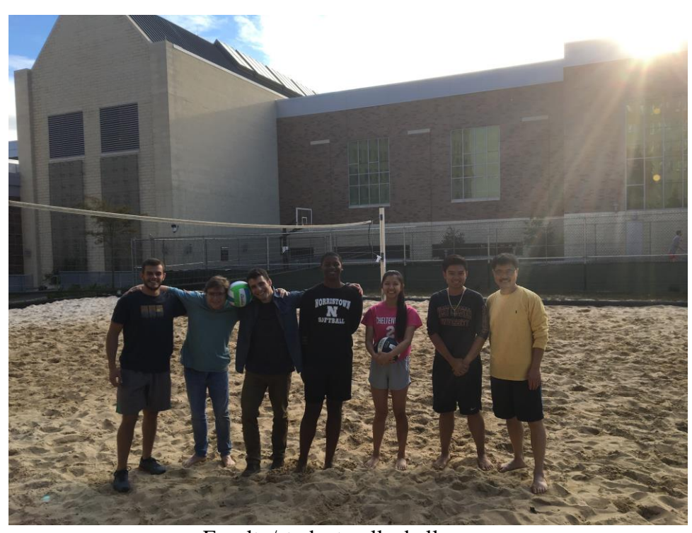
Faculty/student volleyball game