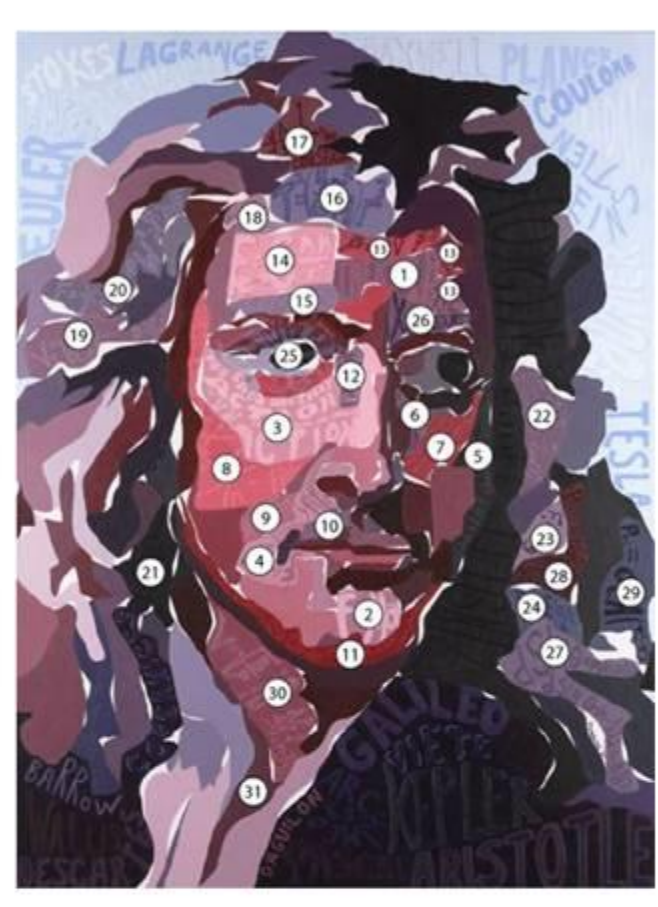
Key can be found at: http://spencertomberg.com/Newton%20description s.html